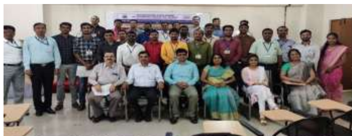
Participants: 31 Teaching Faculties from Pune Region MSBTE affiliated Polytechnics

ONE WEEK FACULTY DEVELOPMENT TRAINING PROGRAM (FDTP) on "SOLID MODELING USING CAD SOFTWARE (CREO)" (3 rd to 7 th February 2020)