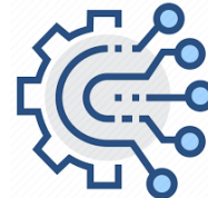
ELECTRONICS AND TELECOMMUNICATION ENGINEERING