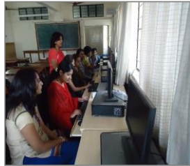
Modeling & Simulation