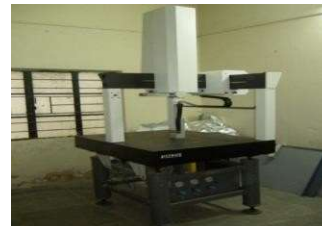
Metrology and Quality Control