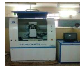
Machine Tool Lab