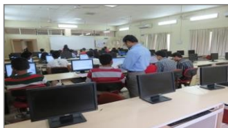
Network and Information system design lab