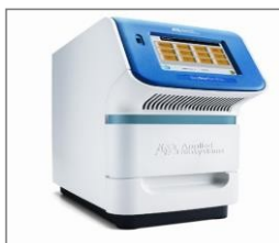
ABI StepOne RT PCR