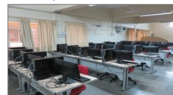
Software Engg. and Computer Graphics lab