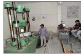
Testing of Materials