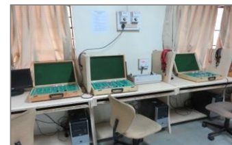
Digital/ Hardware lab