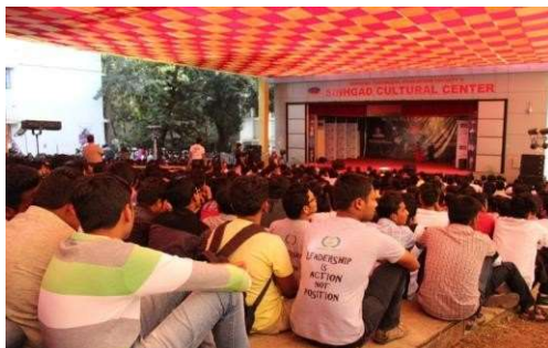
Open Air Cultural Center