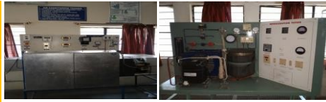
Refrigeration and Air Conditioning