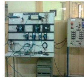
Industrial Fluid Power Lab