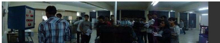
Thermodynamics and Internal Combustion Engine Lab