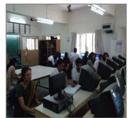
Microwave and Measurement Optical Fiber Communication VLSI & Signal Processing