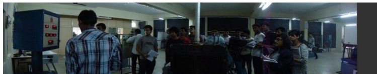
Thermodynamics and Internal Combustion Engine Lab