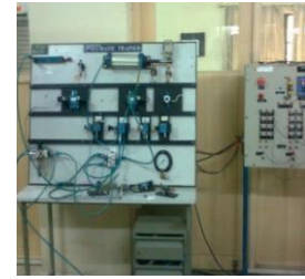
Industrial Fluid Power Lab