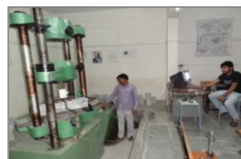
Testing of Materials