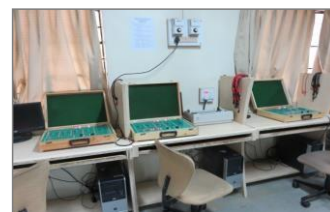
Digital/ Hardware lab