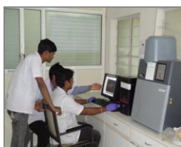
Gel Documentation System