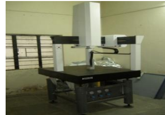
Metrology and Quality Control