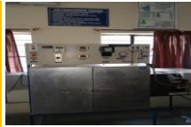
Refrigeration and Air Conditioning