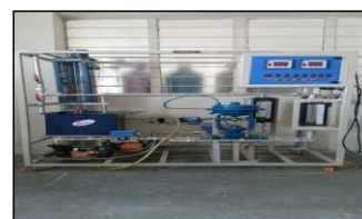
Process Dynamics And Control