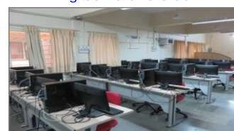
Software Engg. and Computer Graphics lab