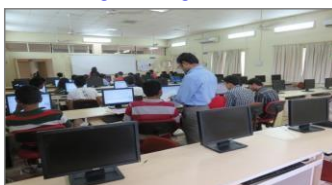
Network and Information system design lab