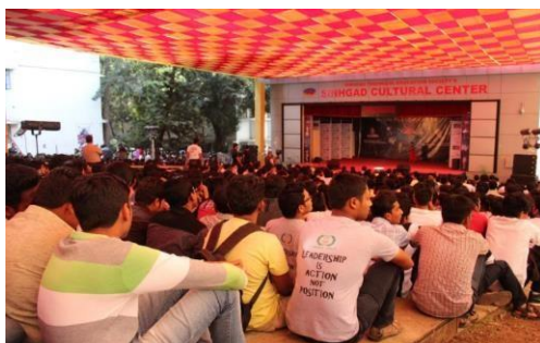
Open Air Cultural Center