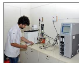
New Brunswick Fermenter