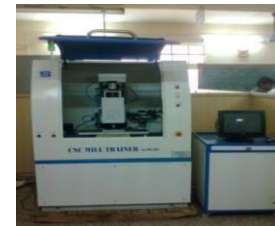
Machine Tool Lab