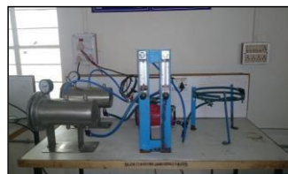
Chemical Reaction Engineering