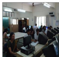
Microwave and Measurement Optical Fiber Communication VLSI & Signal Processing