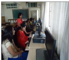
Modeling & Simulation