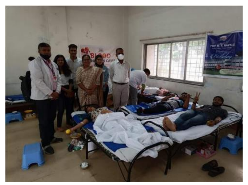
Staff and students while donating blood and checking HB for blood donation

(Affiliated to Savitribai Phule Pune University, Pune & Approved by AICTE) S. No. 40, Kondhwa –Saswad Road, Kondhwa (Bk), Pune – 411048 Website: sae.sinhgad.edu