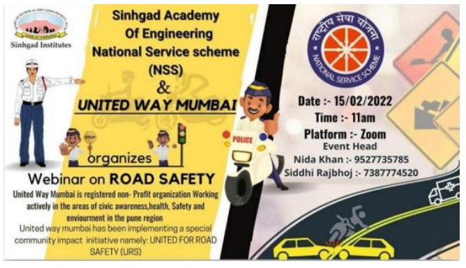
Poster of Road Safety Webinar for Promotion

explained about road safety signs, printed symbol or lines on road surface, which type of helmets should be use by rider & pillion etc and in the end of session they cleared all doubts of participant and provided the link for feedback, after submission of feedback form participate got the certificate of participation.