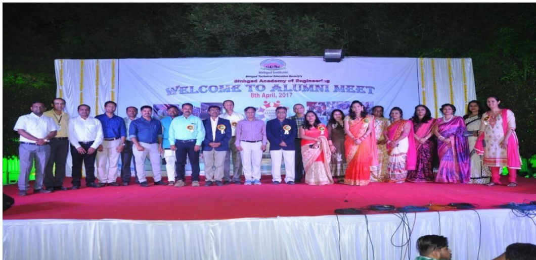
7 th Alumni Meet