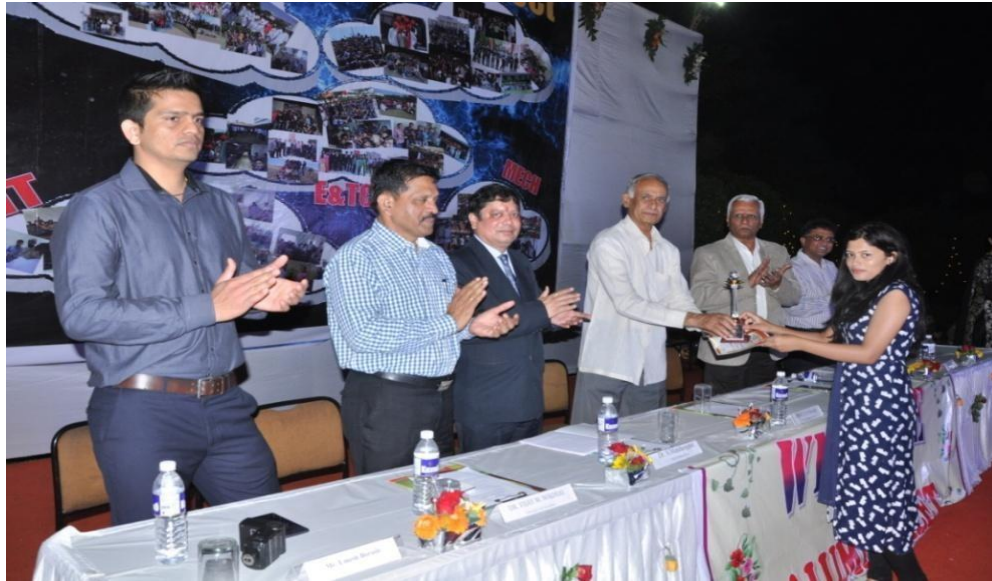
6 th Alumni Meet