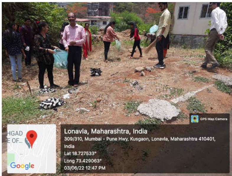
Swachh Bharat Abhiyan activity