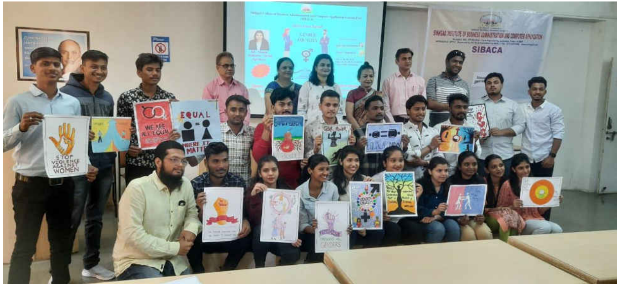
Poster making competition gender equality