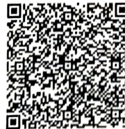
Director ATAL Academies