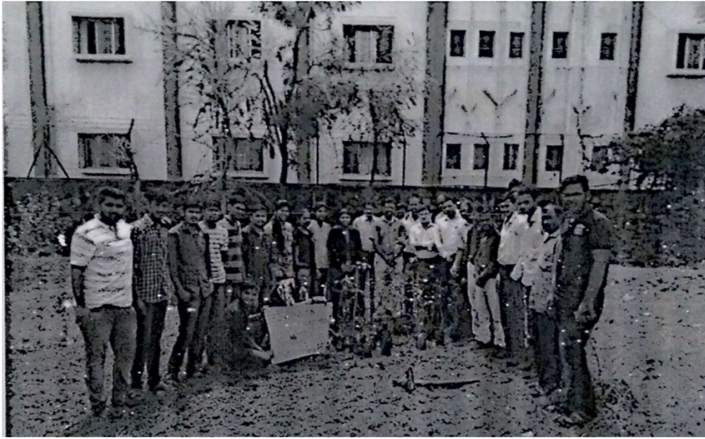
Inauguration of Tree Plantation Program