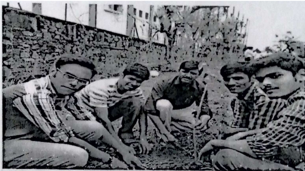
Tree Plantation by Students and Staff