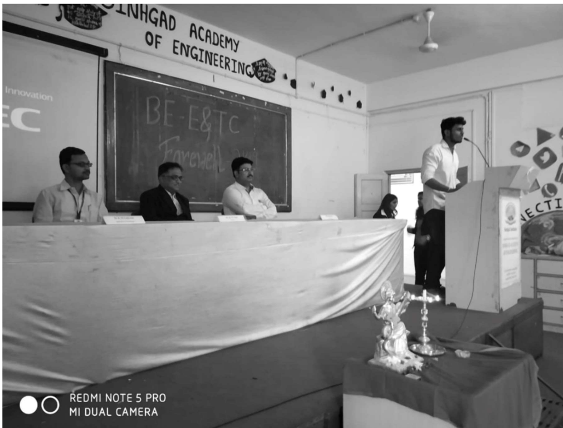
Students Speech on Engineer's Day