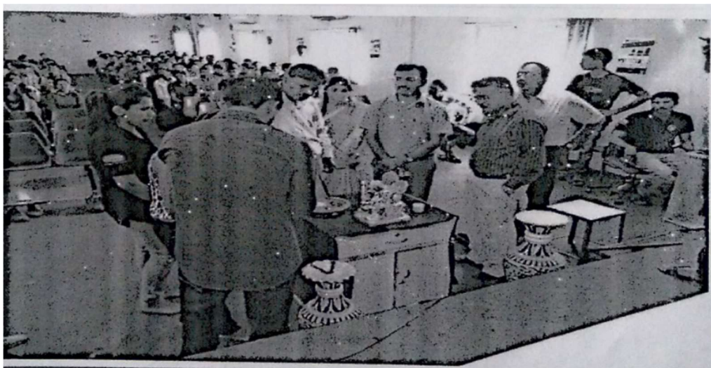
Inauguration of Teachers Day

All teachers were felicitated with a pen and first part of program ended with Kore sir's and Shilwant sir's speech expressing their thoughts. Then came the most awaited moment of the day, game zone. Many interesting were arranged and all teachers participated actively in it. End of the day came with some snacks and was program completed successfully.