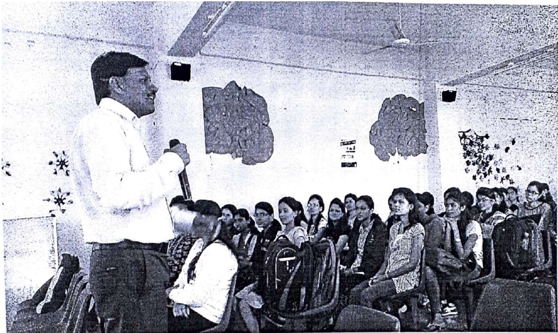
Guest Lecture on “Personality Development”

Coming to the 4Q's, it includes – Physical quotient, intelligent quotient, spiritual quotient and emotional quotient. When one has achieved in gathering all these, his personality is pretty much perfect and give a great presentation. Sir made the session interesting and very lively with jokes, videos, to keep everyone attentive and interested.