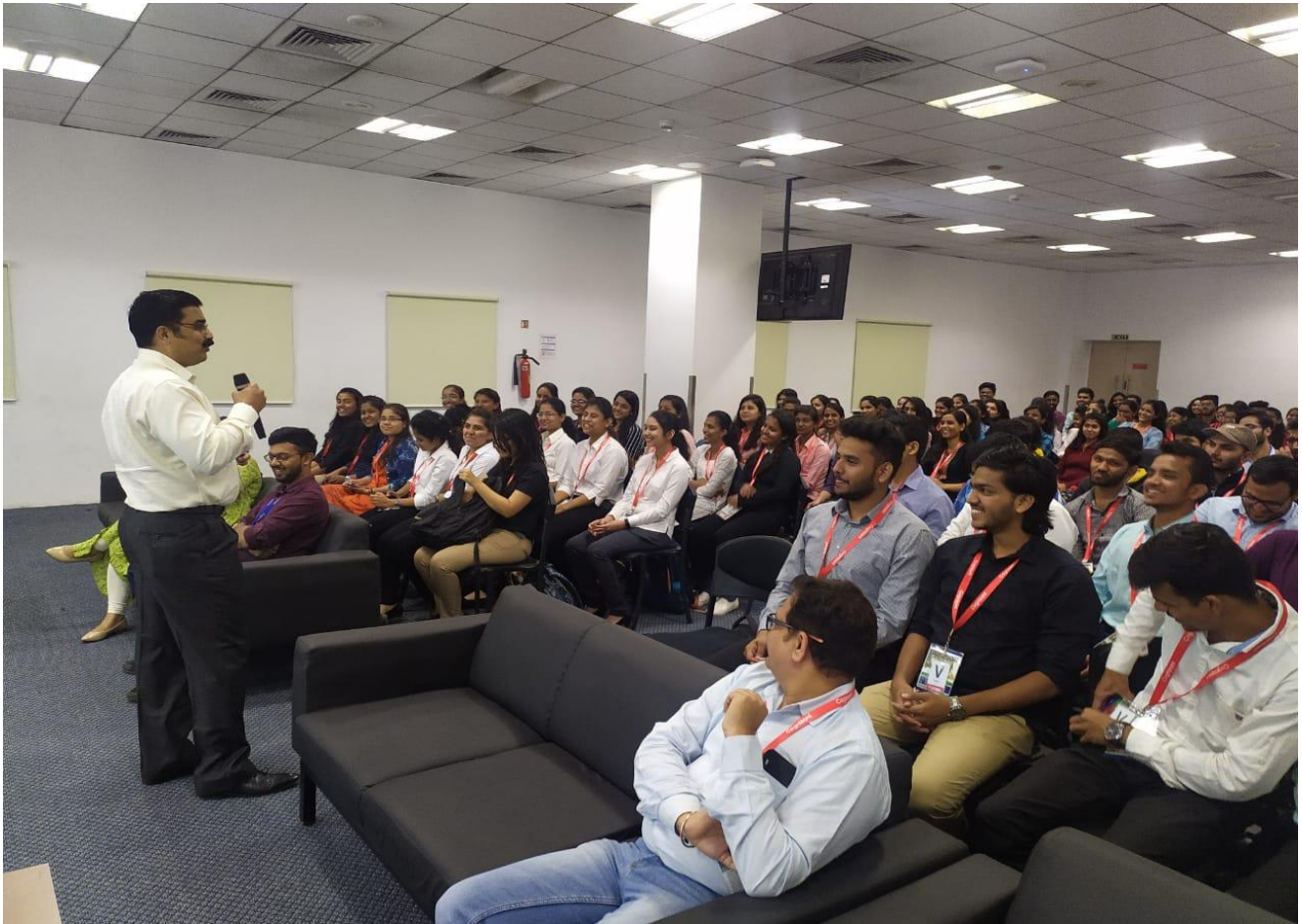
Student Centric activity .