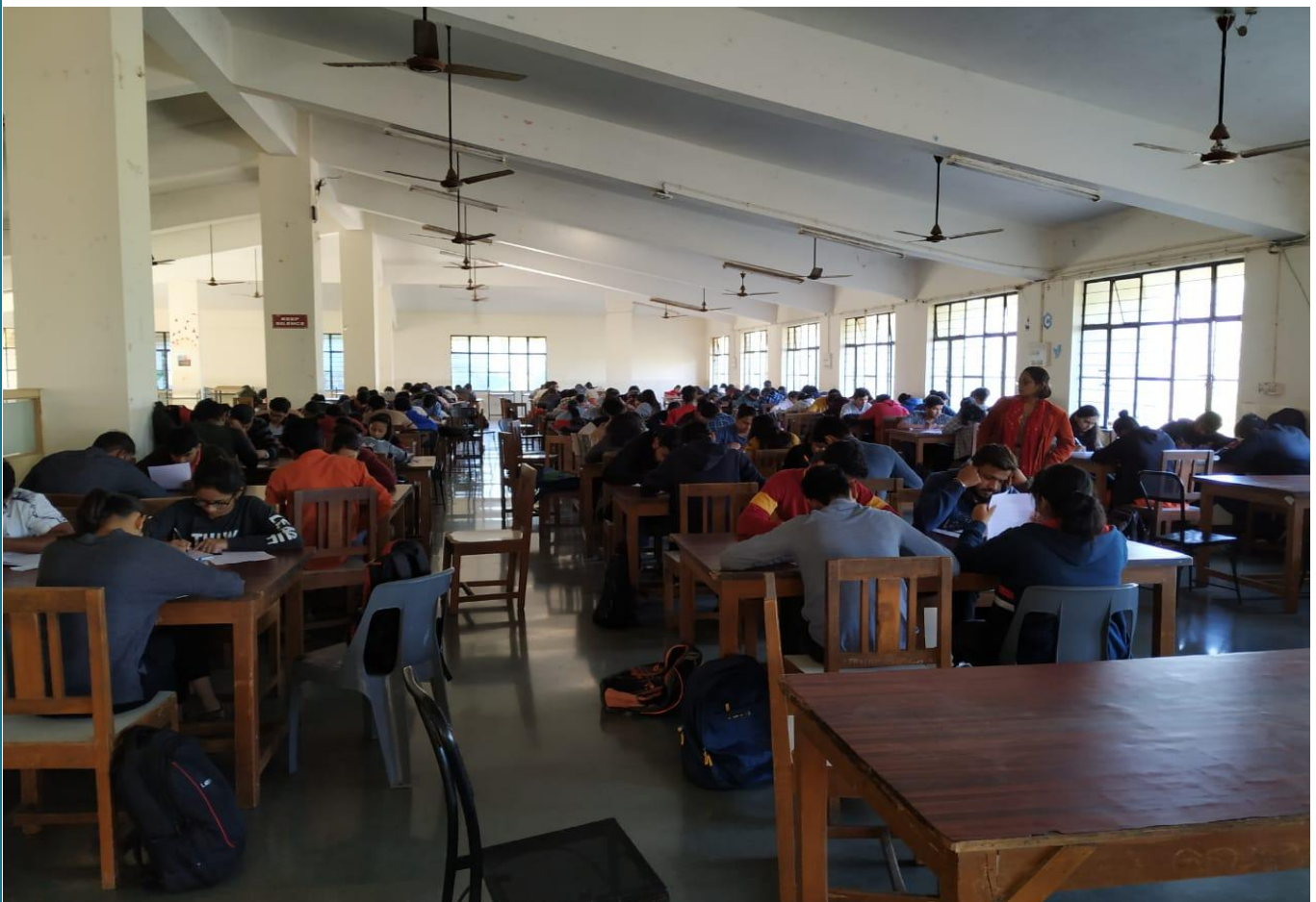
Pictorial moments of Employability test