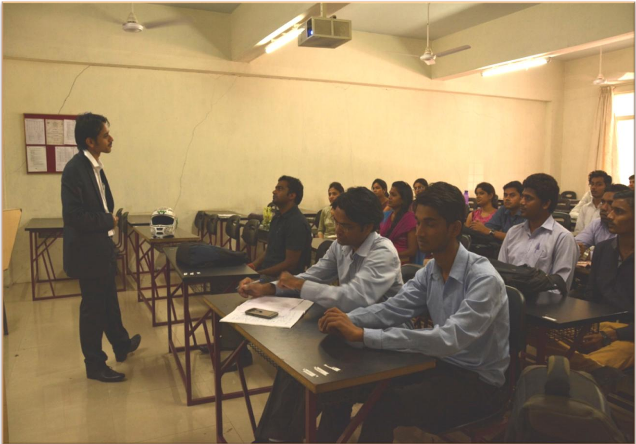
Alumni interacting with MBA-I students