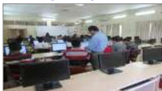
Network and Information system design lab