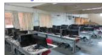
Software Engg. and Computer Graphics lab