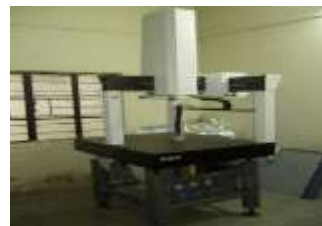
Metrology and Quality Control