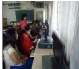
Modeling & Simulation