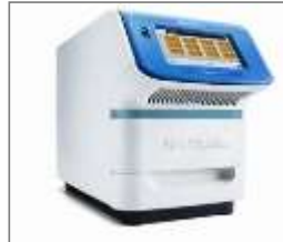
ABI StepOne RT PCR