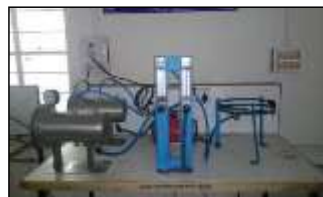
Chemical Reaction Engineering