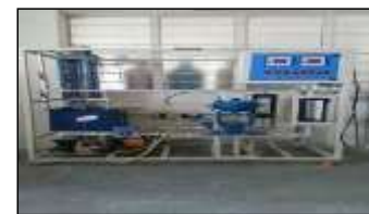
Process Dynamics And Control