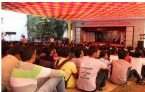
Open Air Cultural Center