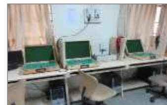
Digital/ Hardware lab