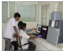
Gel Documentation System