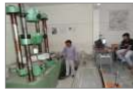
Testing of Materials