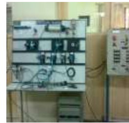
Industrial Fluid Power Lab