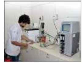
New Brunswick Fermenter