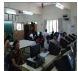
Microwave and Measurement Optical Fiber Communication VLSI & Signal Processing