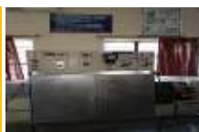
Refrigeration and Air Conditioning