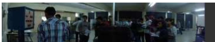
Thermodynamics and Internal Combustion Engine Lab