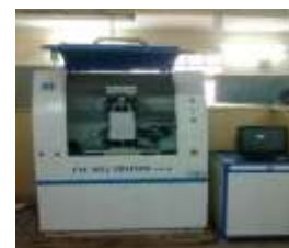
Machine Tool Lab