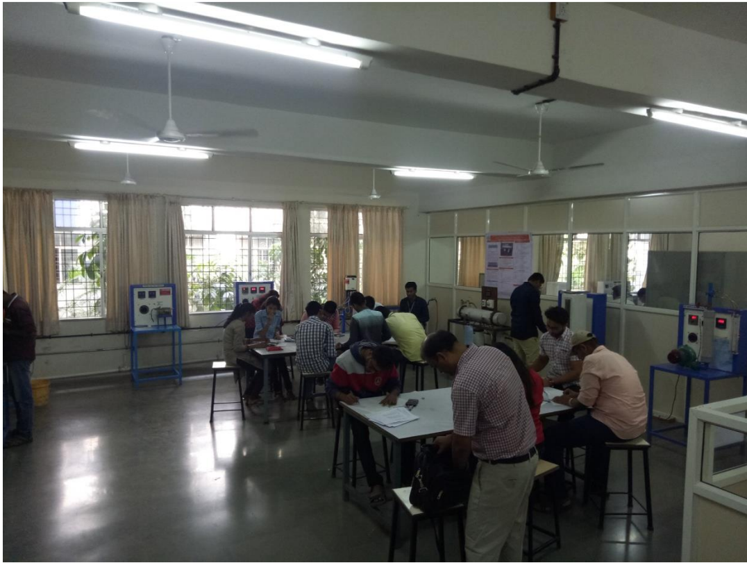
Heat Transfer Laboratory