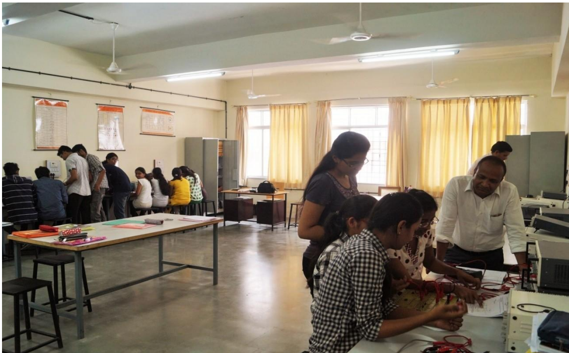
Electronics Devices & Circuits Laboratory