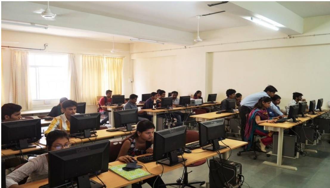
Digital Signal Processing Laboratory