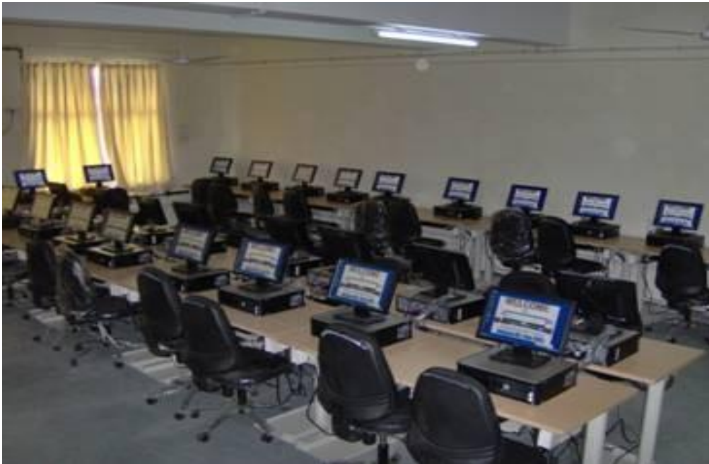
Central Computing Facility