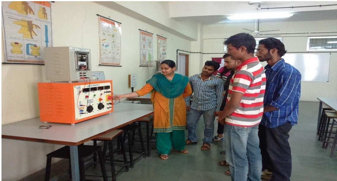
Switch Gear Laboratory