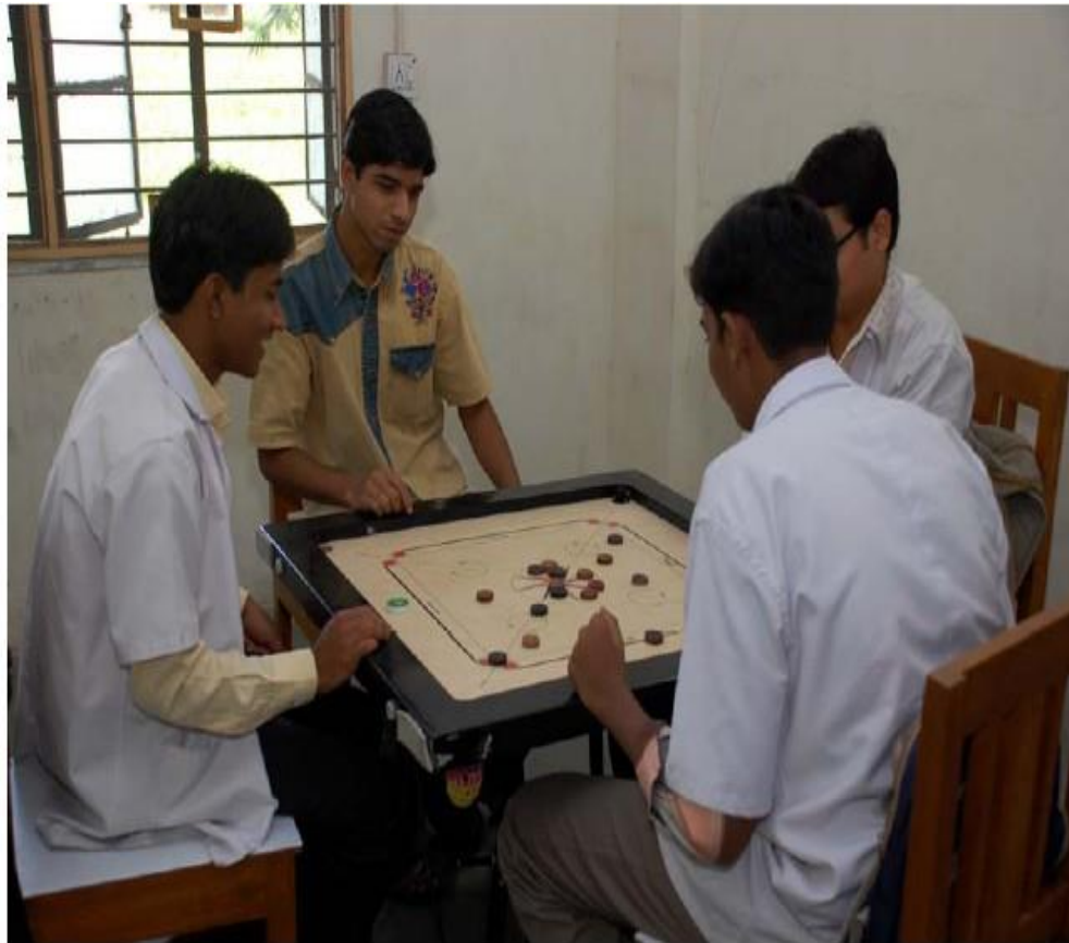
INDOOR SPORTS FACILITIES