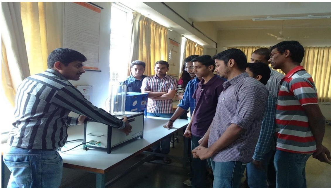
High Voltage Laboratory