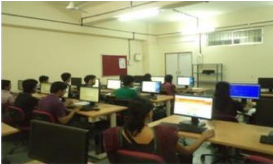
Software Engineering Laboratory