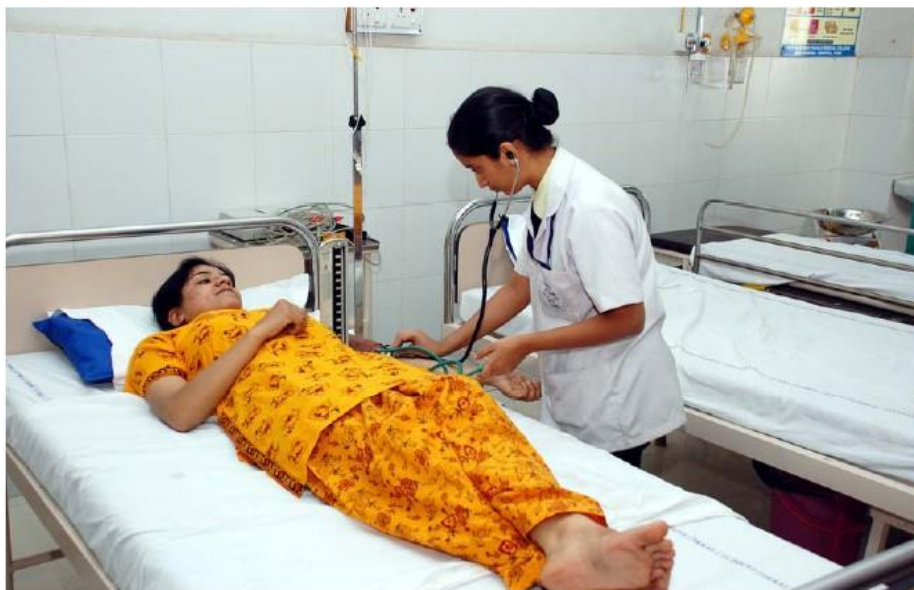
MEDICAL & OTHER FACILITIES AT HOSTEL

(Campus Clinic, Dental Hospital, Medical Stores, Laundry, Fruit & Juice Bar, Barbour Shop, Stationary Stores etc.)